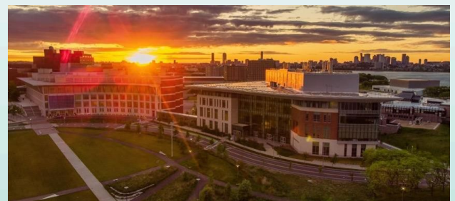
UMass Boston's Campus

UMass Boston collaborates and promotes green transit options working with the MA Leading By Example Program, Second Nature Climate Commitment as well as the UMass System Sustainability Policy and annual reporting. UMass Boston has been recognized annually as one of Princeton Review's Green Colleges Campuses in the country since 2010.