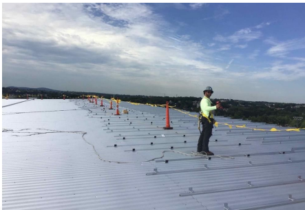
UMass Boston's Solar Photovoltaic System

UMass Boston announced a new project at the MassEVolves 2020 Recognition Event that combines solar and storage with EV charging: a 1,000-kilowatt solar photovoltaic system on the roof of the University's parking garage, a 500-kilowatt lithium-ion battery system, and 11 EV charging stations.