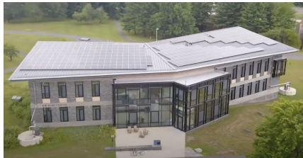
The R.W. Kern Center

Hampshire provides four 220-volt EV charging stations free to the community, powered partly by the college's solar fields. There's a time limit of three hours, and employees can work together to make sure that all vehicles are able to be charged daily as needed.