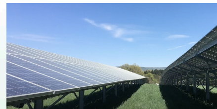
One of Hampshire's Two Solar Fields

Some of Hampshire's other sustainability efforts include a bike share and repair program, an onsite campus farm and CSA, two large-scale solar fields with capacity to provide for all campus electrical needs, and a residential composting program. Many of these programs started as student projects or were championed by student groups. Over the next two years, Hampshire hopes to grow their charging capabilities, offer educational test drive events for the community, generate an annual sustainability report with a section on transportation, and transition campus fleet vehicles to electric, including the President's personal vehicle.